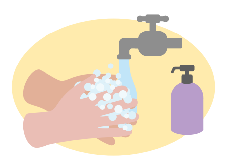
Everyone who handles the horse should thoroughly wash their hands afterwards, or use hand wipes.