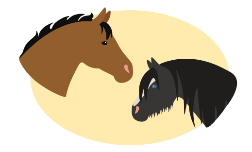
Group any horses who've been in close contact with the sick horse to try to contain the spread of disease.