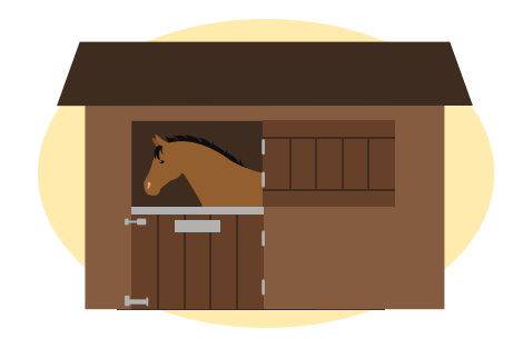
Draw up a map of all stables on the yard and note the occupants so you can track movement of horses.