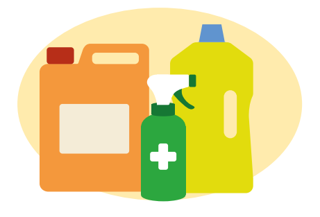
You'll need both detergents and disinfectants – most household varieties are suitable.